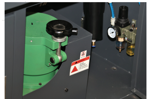
Sealed glue pot to reduce waste