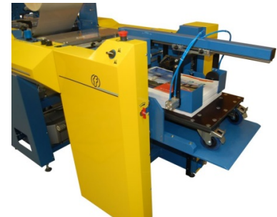
Optional Pallet Stacker